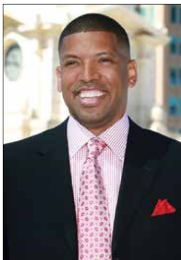
Mayor Kevin Johnson

In May 2013, Ballard Spahr was selected to represent the National Conference of Black Mayors (NCBM) and Kevin Johnson, its President, who is the Mayor of Sacramento, a former NBA All-Star, and the current President of the United States Conference of Mayors. Founded in 1974, the NCBM provides information