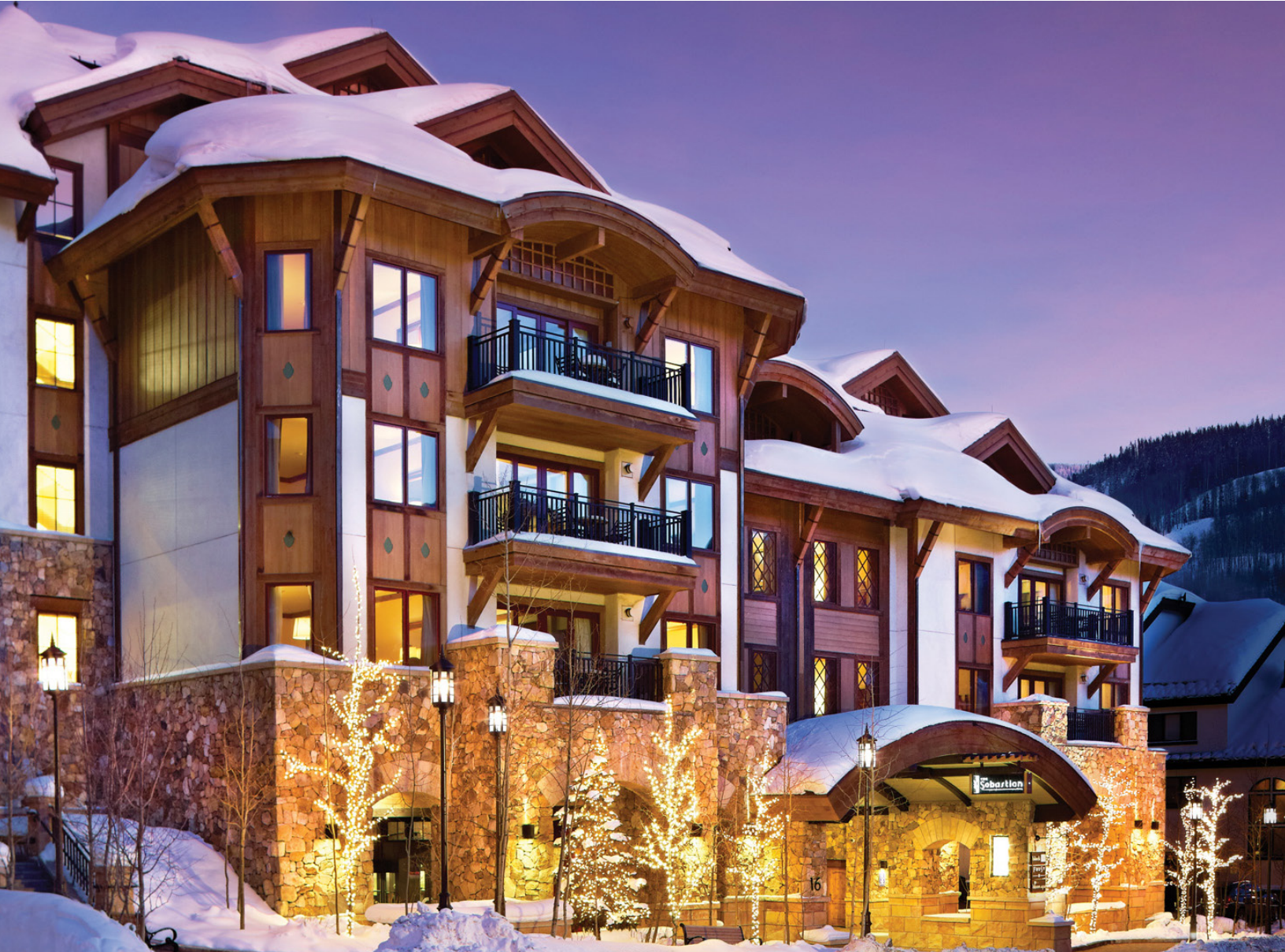
The Sebastian - Vail, A Timbers Resorts Hotel & Residence Club