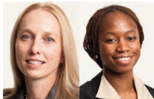
Mary Gay Scanlon